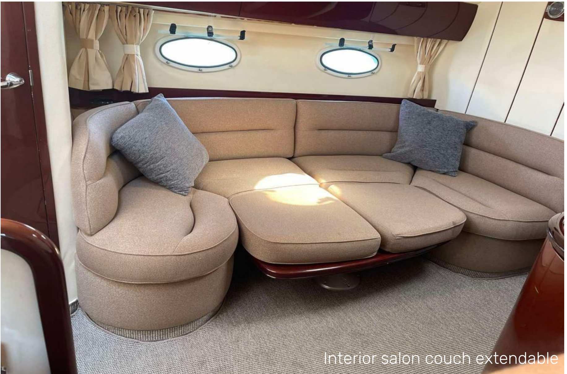
Interior salon couch extendable