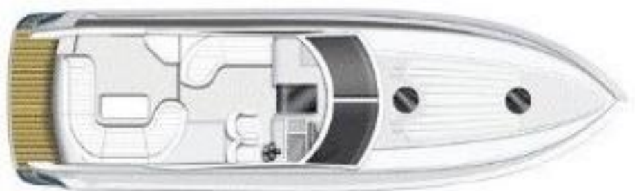
Standard cockpit layout

Crew (captain) : In main compartment (in twin cabin)