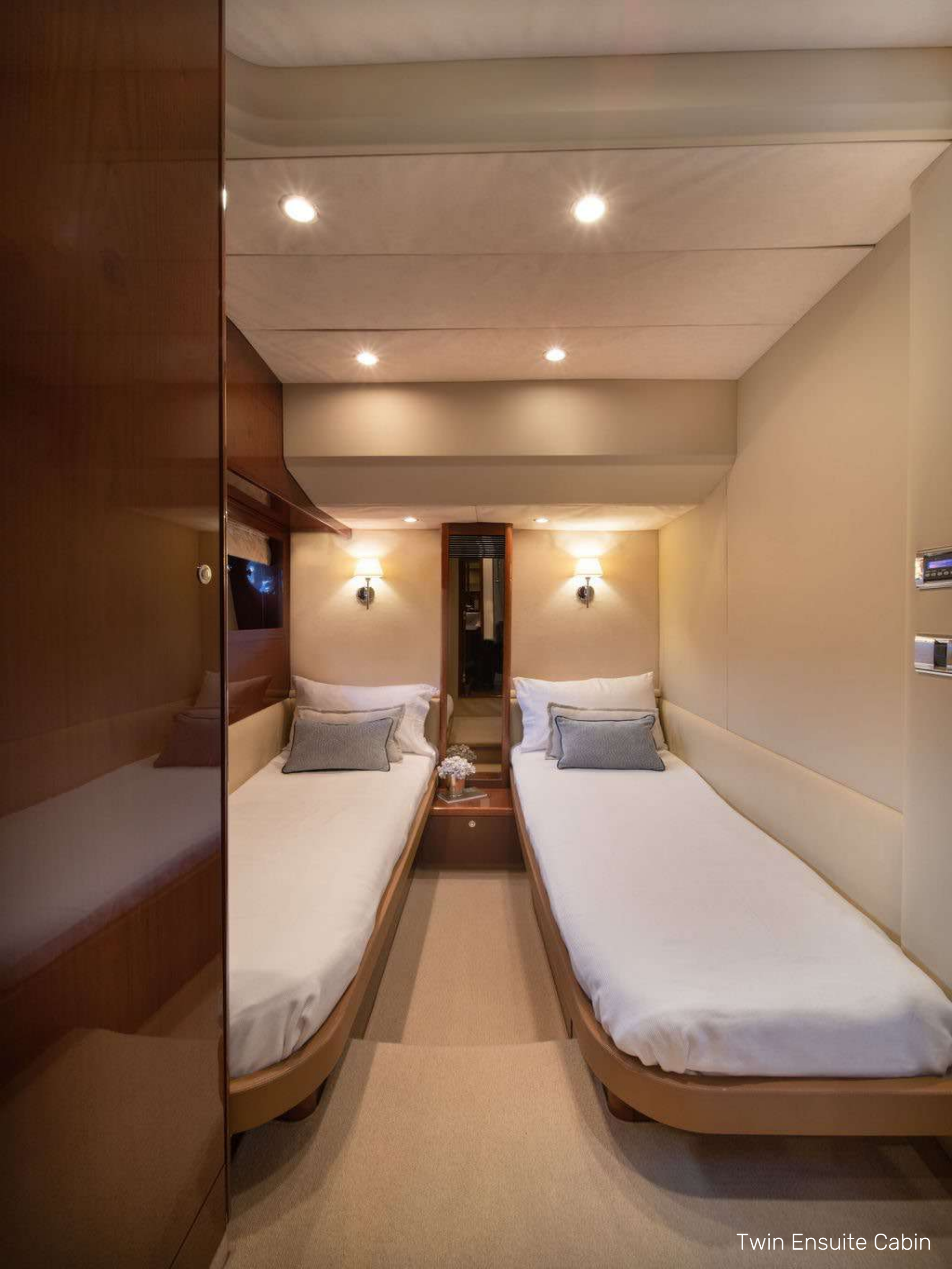
Twin Ensuite Cabin