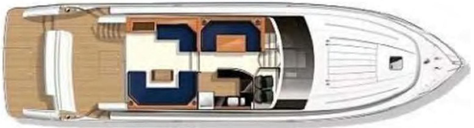
Upper accommodation layout