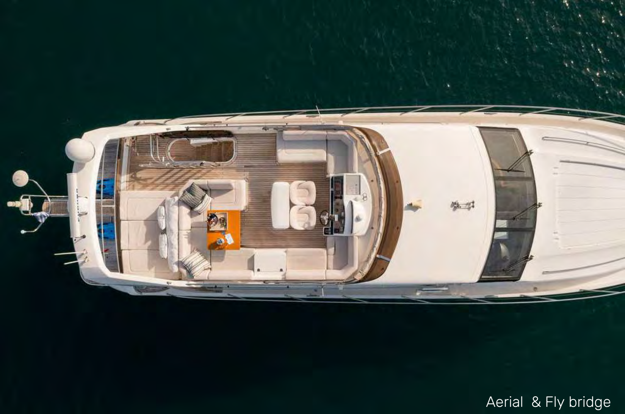
Aerial & Fly bridge