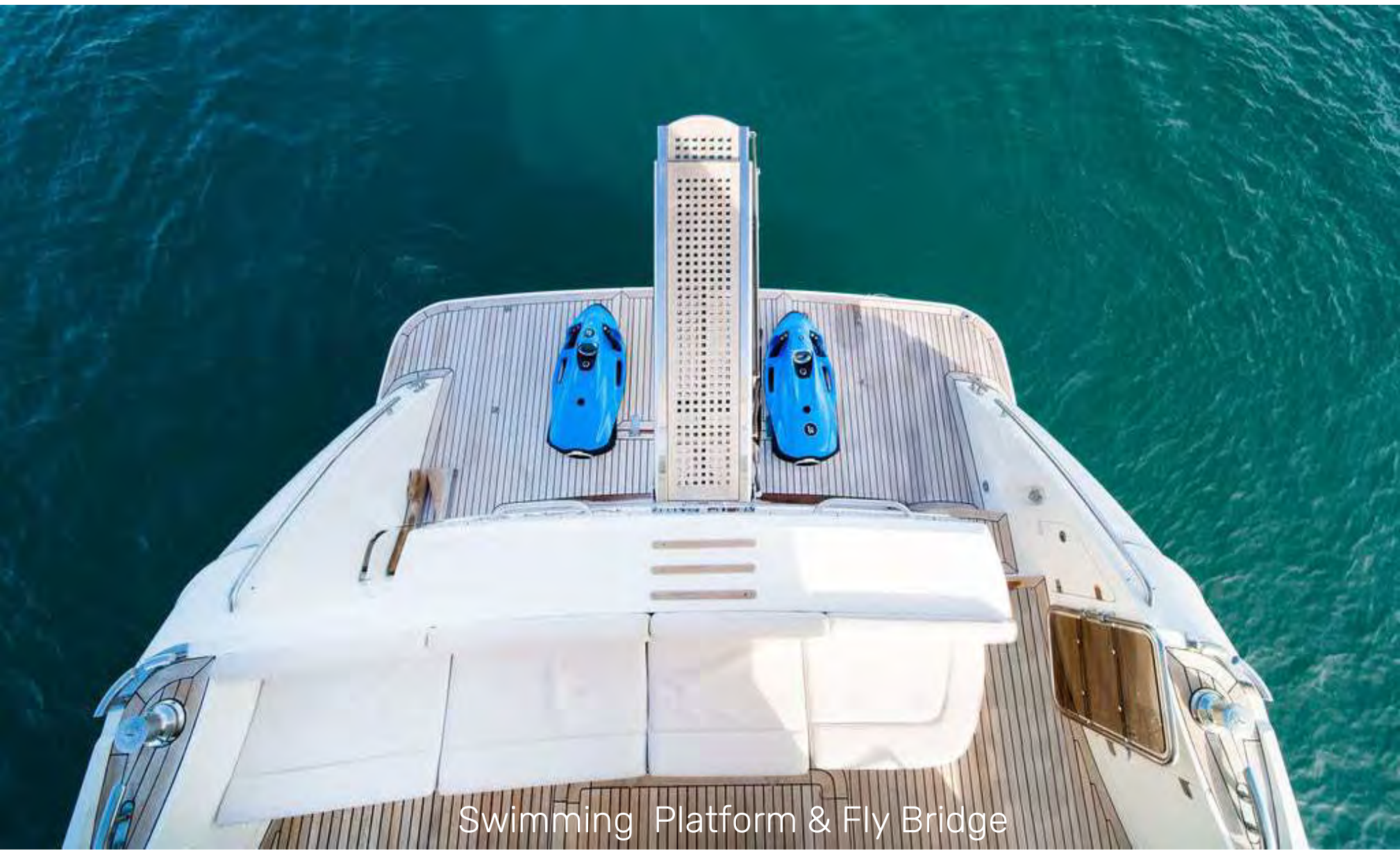
Swimming Platform & Fly Bridge