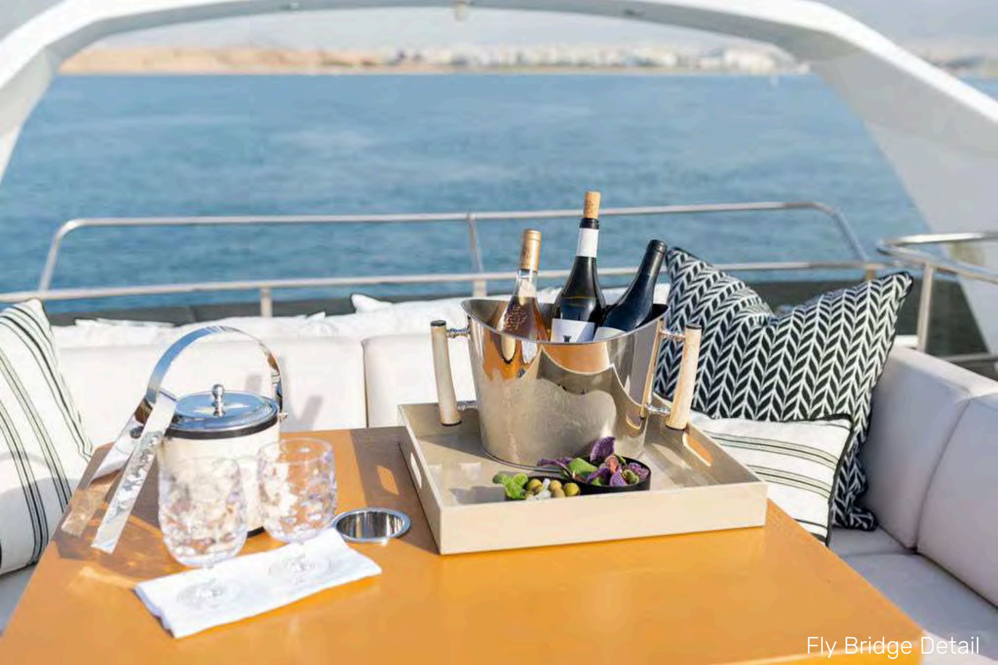
Fly Bridge Detail