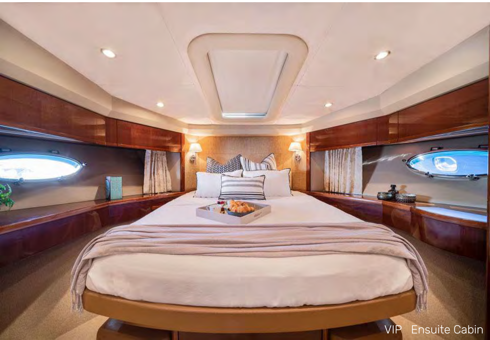
VIP Ensuite Cabin