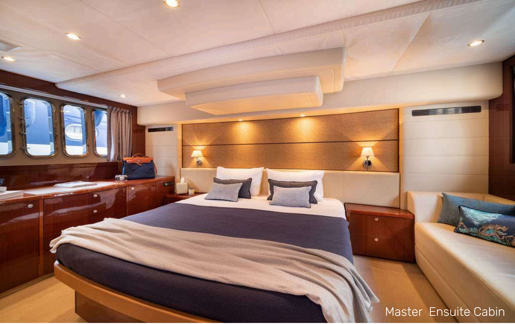
Master Ensuite Cabin