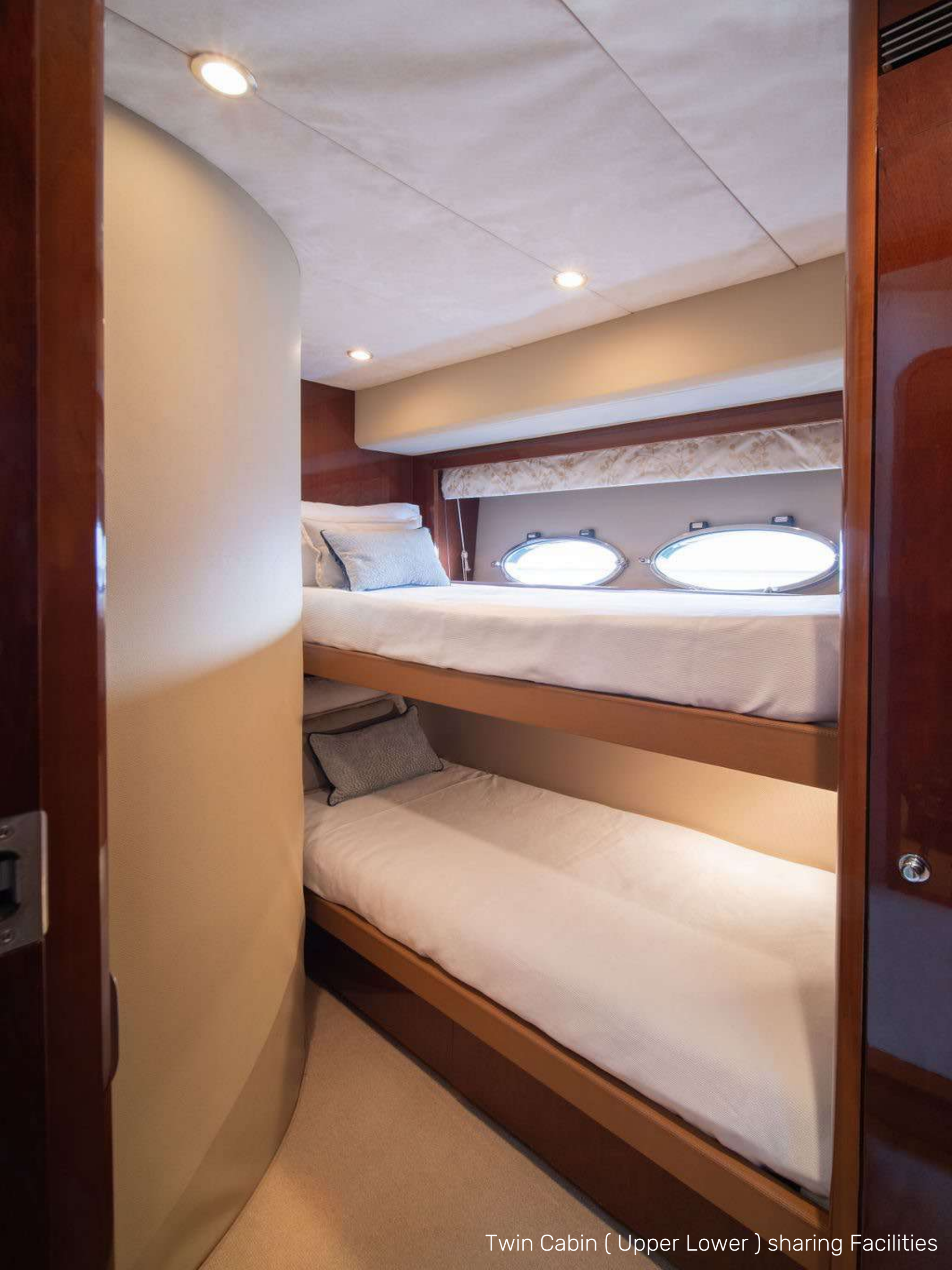
Twin Cabin ( Upper Lower ) sharing Facilities